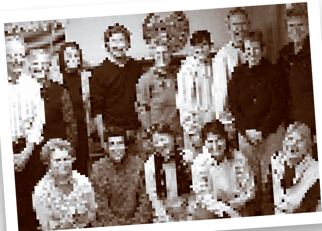
Happy members of the Whidbey Giving Circle

This group of Island residents decided that they wanted to do something positive for their local LGBT community, especially youth on the Island. And with no dedicated LGBT organizations on the Island, Pride Foundation had not made a grant in the area for many years.